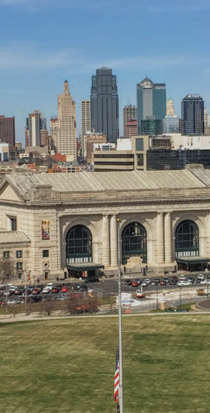
Exhibit Hall Times