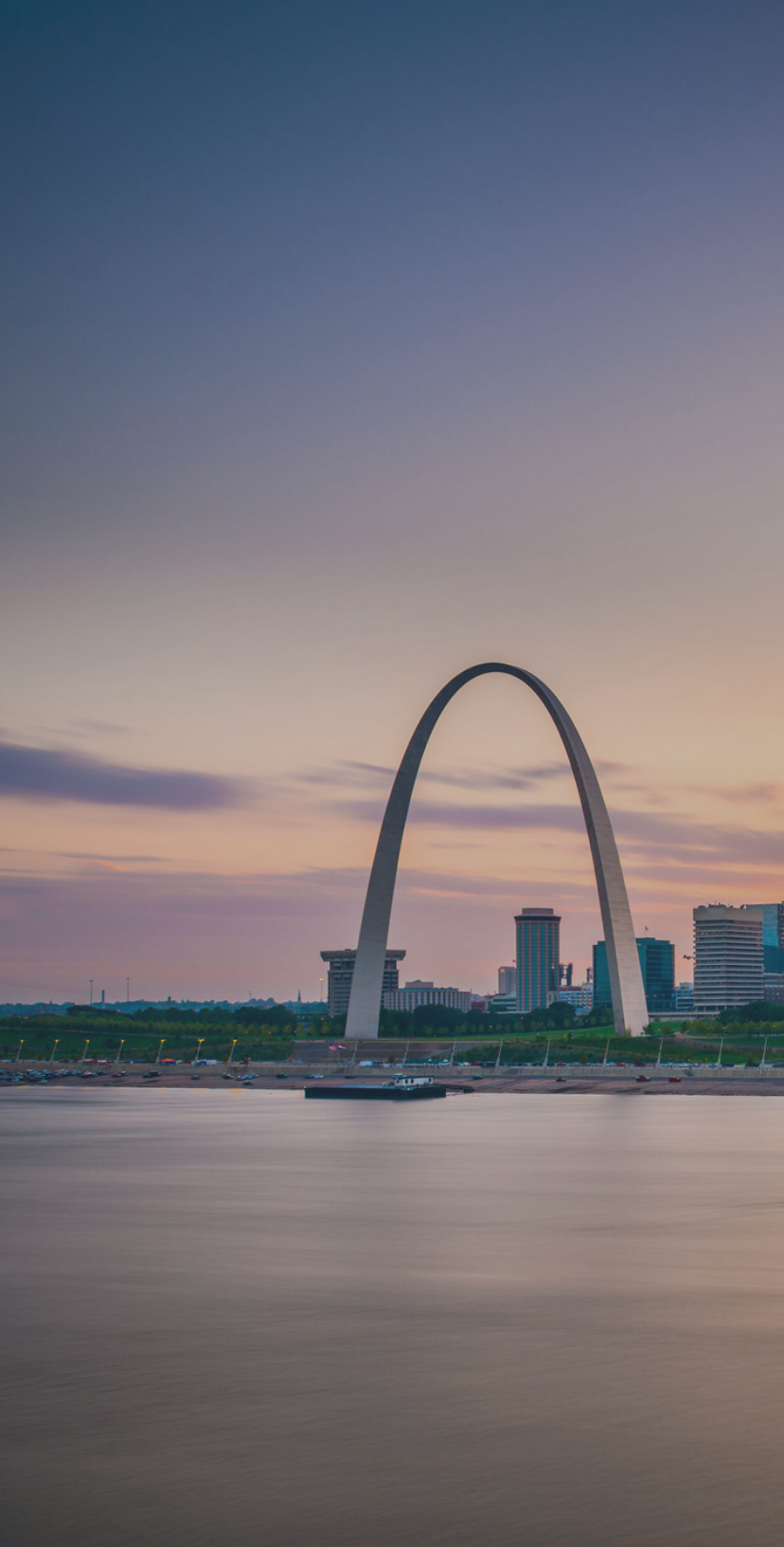
Exhibit Hall Times